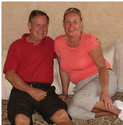
Left: Compelling reading!