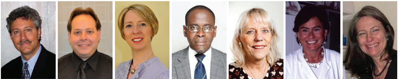
2016 IADT Directors of the Board

It has been a busy time and many Board members have given an enormous amount of personal time and effort in helping the Association grow and prosper. Over the past two years we have held a World Congress in Istanbul, launched the IADT Fellowship and continue to plan for the next World Congress in Sydney Australia as well as a myriad of other administrative tasks completed. I look forward with enthusiasm to working with our new Board members to continue this work.