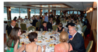
Delegates enjoying the gala conference dinner