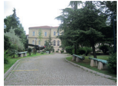
The Military Museum Istanbul