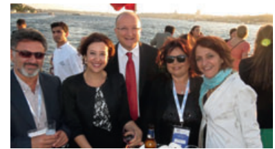
Several of the local organizing committee enjoying the conference dinner